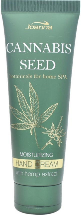
Joanna Home Spa – Hand cream with hemp extract (cannabis sativa seed extract)