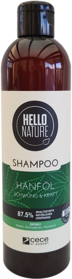
Cece Hello Nature – Shampoo with natural hemp oil (cannabis sativa seed oil)