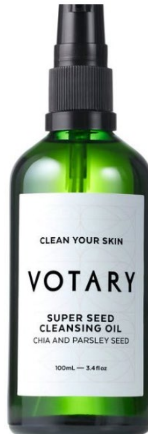
Votary – Super seed cleansing oil with cannabis sativa seed oil