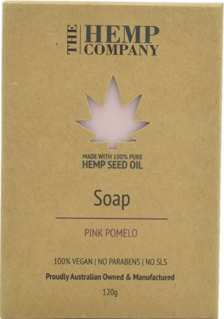
The Hemp Company – Bar soap with cannabis sativa seed oil