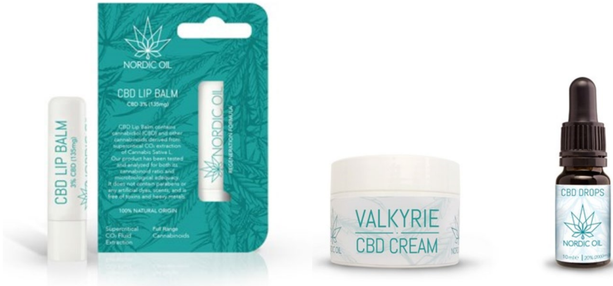
Nordic Oil – Personal care products (e.g. lip balm, cream, oil) with CBD active agent