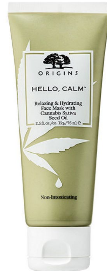
Origins – Face mask with cannabis sativa seed oil