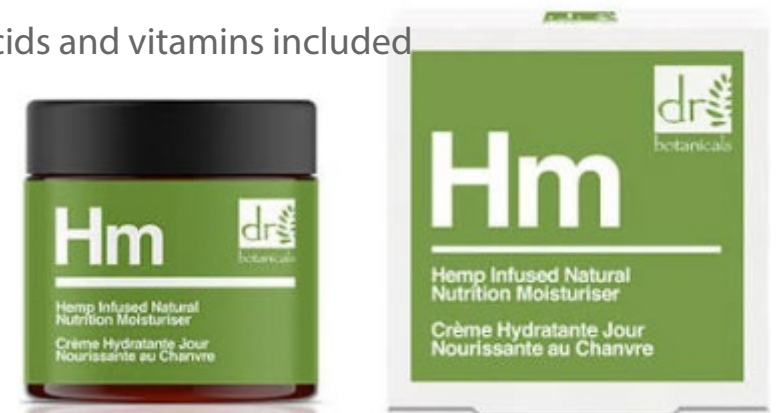
Hemp seed oil infused moisturising cream