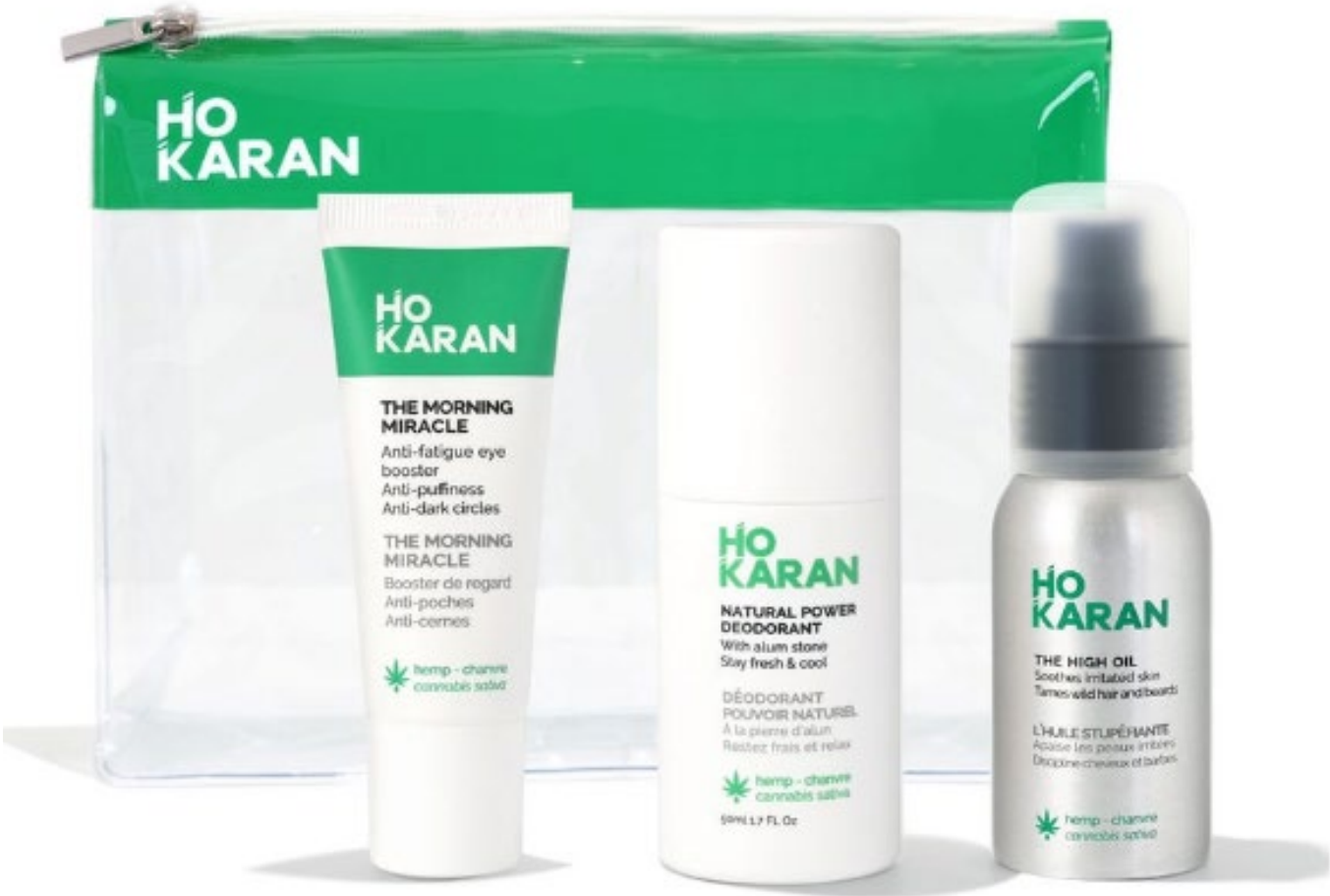
Ho Karan – Natural skin care products with cannabis sativa oil