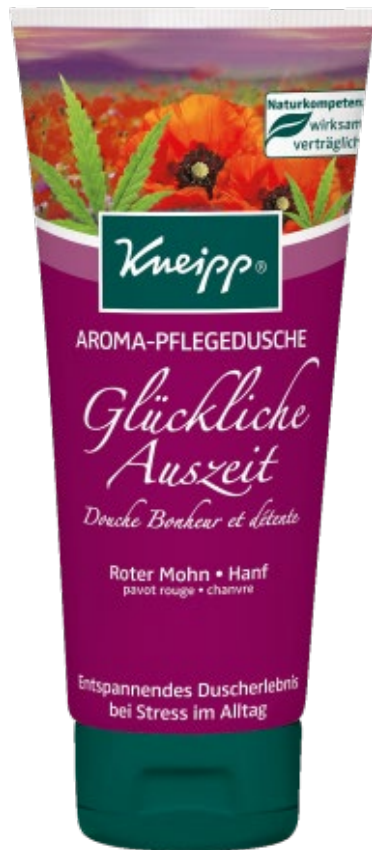
Kneipp – Aroma nourishing shower with natural hemp oil (cannabis sativa seed oil)